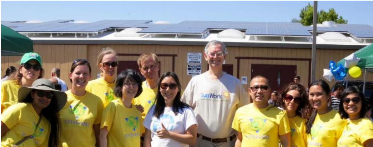
SSV celebrating at EHP BlockFest with Mitsubishi Corporation, SunWork and BAAQMD